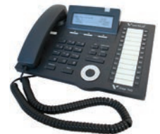
Edge 700 24-Button Phone