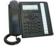
Edge 8000 24-Button Phone

MBX IP delivers IP applications on the following Vertical IP endpoints and softphone solutions*